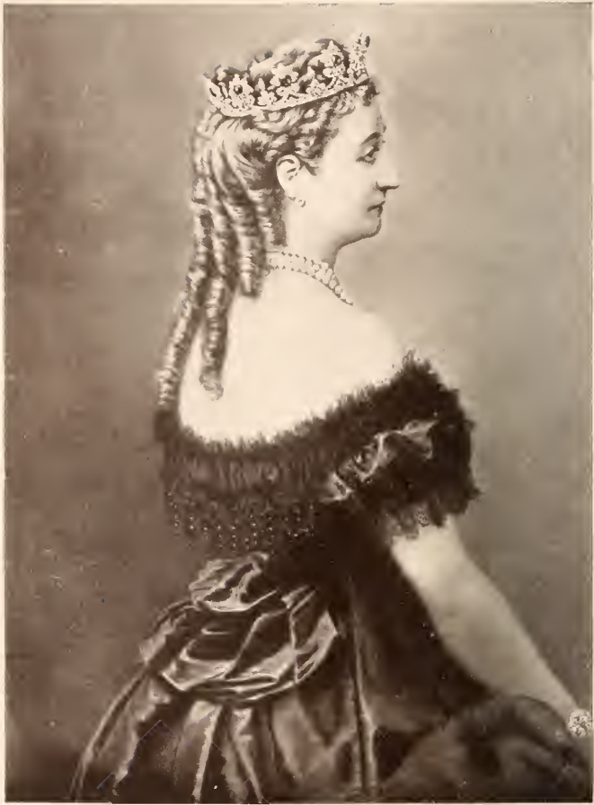
THE EMPRESS EUGÉNIE. From a photograph taken about 1865.